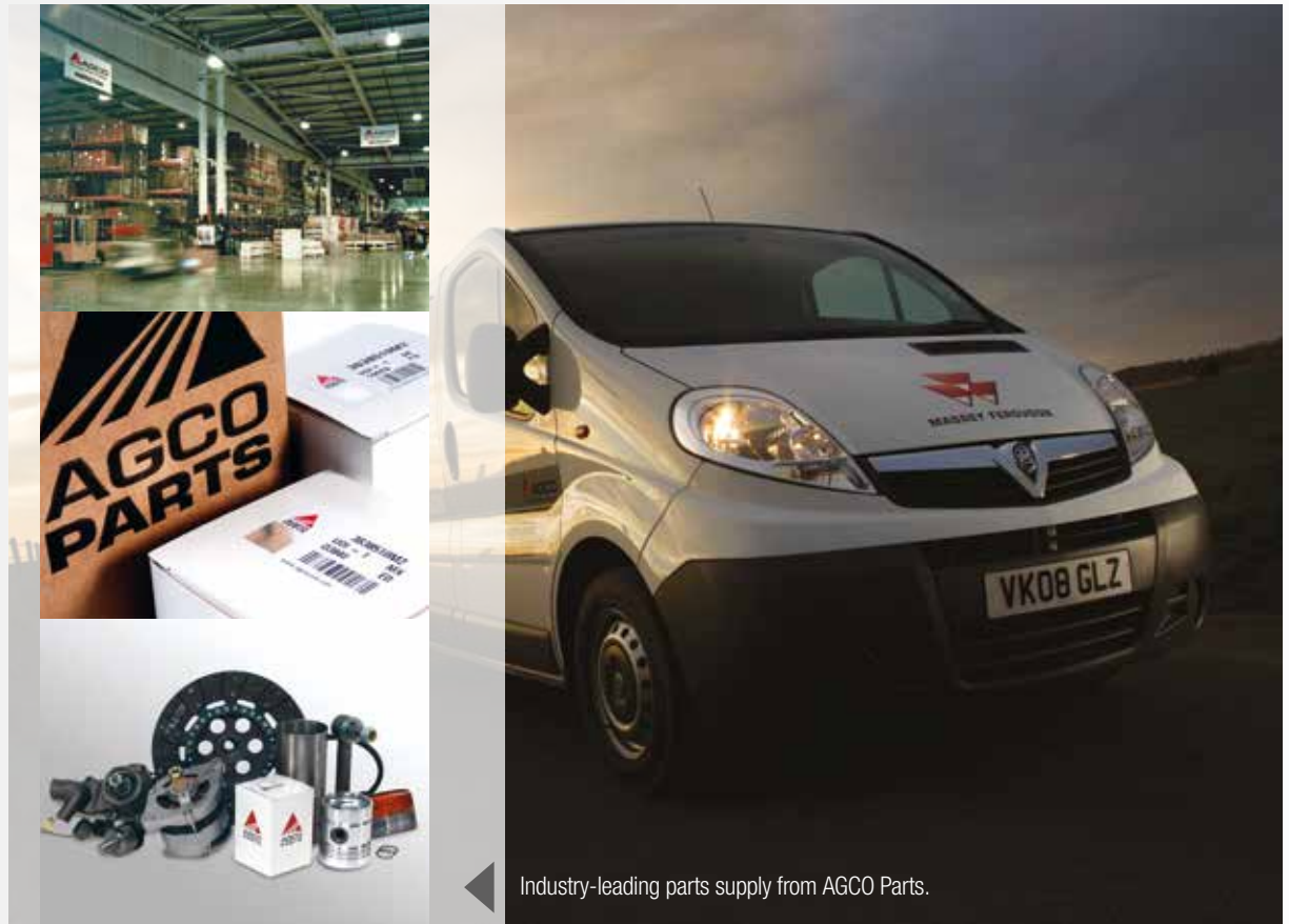
Industry-leading parts supply from AGCO Parts.

In addition to manager service, an extended warranty plan is also available for new equipment up to 12 months old and cover is offered up to 5 years or 6,000 hours. This option provides you not only the benefits of the service plan, but also includes full Massey Ferguson extended warranty cover offering you the ultimate protection against the unforeseen.