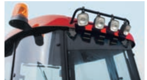
▲ Optional rotary beacon and worklights, help you stay safe on the road and in the field.

Stay until the job is finished. When you have to meet a deadline and must work late, you can have confidence in JX. With up to six roof mounted worklights available to light the way and a rotary beacon for transport work, you can safely stay until the job is finished.