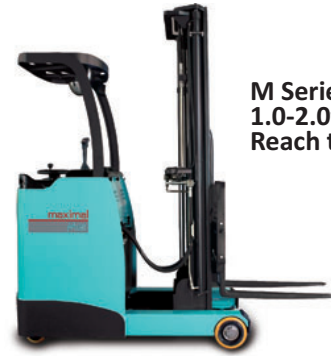
M Series 1.0-2.0ton Reach truck