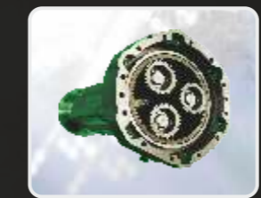
Planetary Gear with Straight axle Low noise, less vibration, highly durable