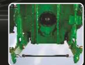
More Lifting Capacity Strength to lift weight up to 2000 kilograms