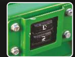
EQRL EQRL switch eases lifting, joining and use of implement