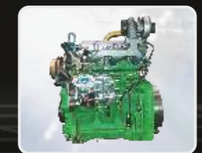
John Deere 3029H engine with Inline FIP Powerful and fuel efficient