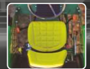
4 Gear Range More gear options for more activities