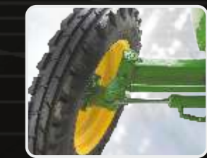
Power Steering Work hard. Drive smooth