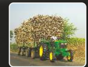
High Torque reserve ~ 38% Suitable for activities that require more pulling power or load bearing