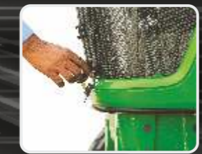
Hood Lock Totally secure