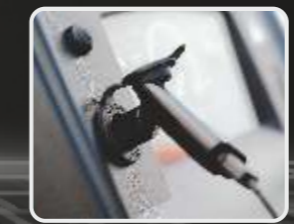
Mobile Charging Point with Holder Stay connected anytime