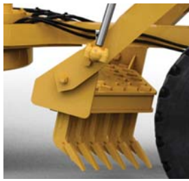
MID MOUNT SCARIFIER