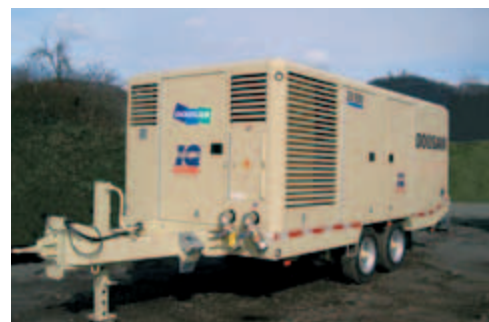
25/330 on optional high speed tandem axle and equipped with optional IQ system.